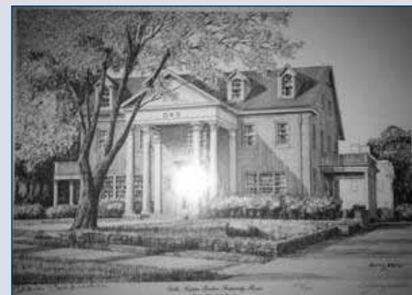
Carolina Blue Matting Included.

The print or prints will be in the mail almost immediately upon receipt of the order. We do believe you will be quite pleased.