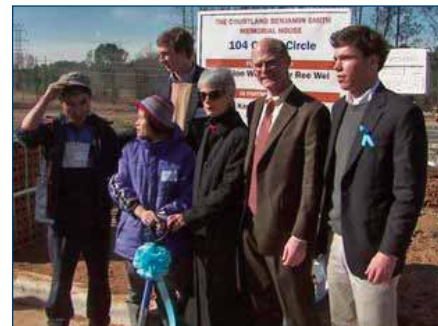
At the groundbreaking for the Courtland B. Smith Habitat for Humanity House.

We have also drafted a new DKE Code of Conduct that lays out clear responsibilities and rules that come with the privilege of being a DKE. The DKE Judicial Board has simultaneously been expanded and its by-laws updated.